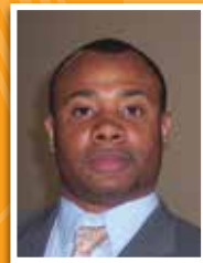
5. London Burnett Cleveland, OH